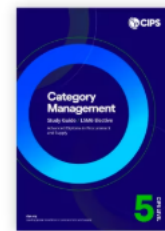
L5M6 Category Management (ELECTIVE) - Study Guide