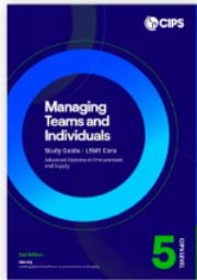
L5M1 Managing Teams and Individuals (CORE) - 2nd edition Study Guide