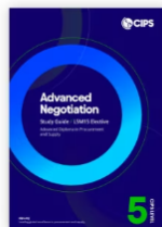
L5M15 Advanced Negotiation (ELECTIVE) - Study Guide

The cost of books is not included in your course fee.