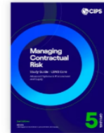
L5M3 Managing Contractual Risk (CORE) - 2nd edition Study Guide