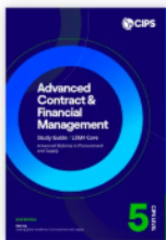
L5M4 Advanced Contract & Financial Management (CORE) - 2nd edition Study Guide