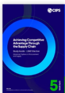
L5M7 Achieving Competitive Advantage Through the Supply Chain (ELECTIVE) Study Guide