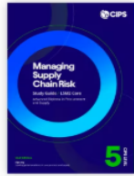
L5M2 Managing Supply Chain Risk (CORE) - 2nd edition Study Guide