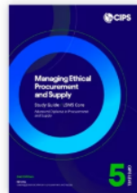
L5M5 Managing Ethical Procurement and Supply (CORE) - 2nd edition Study Guide