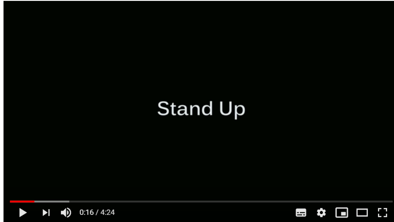
Stand Up! - Don't Stand for Homophobic Bullying