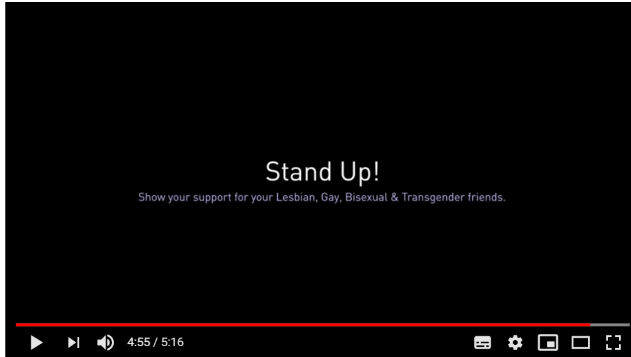
Stand Up for Your Friends